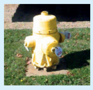
Above ground hydrant