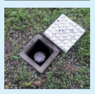
Sewer riser or inspection shaft