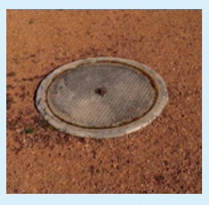
Sewer maintenance hole