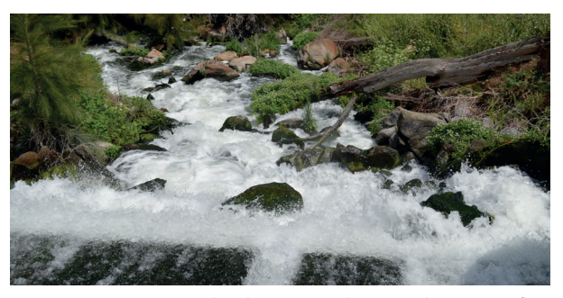
Lower Molonglo Water Quality Control Centre Outflow

Your sanitary drains, our sewerage network and treatment plants are only designed to process degradable substances produced from domestic bathing, showering, toilets and laundry.